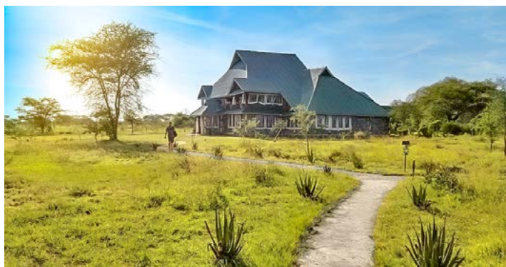
Africa Safari Serengeti Ikoma