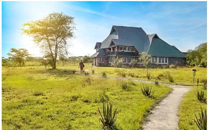
Africa Safari Serengeti Ikoma