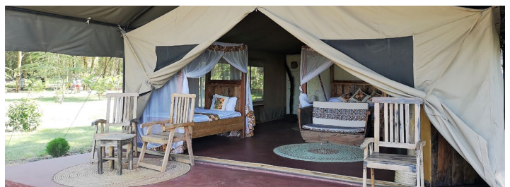
Safari comfort accommodation