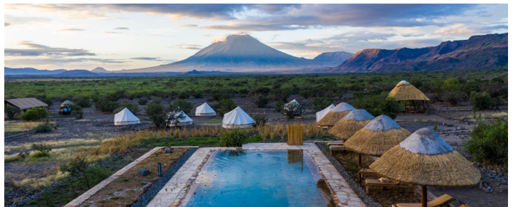
Africa Safari Lake Natron