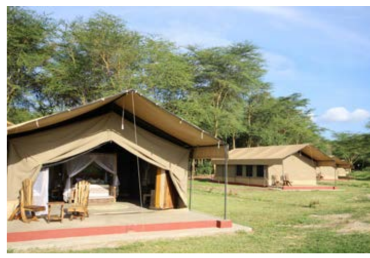
Africa Safari Lake Manyara