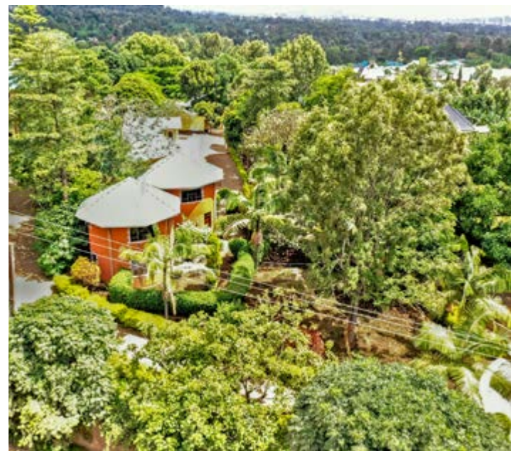
Africa Safari Arusha