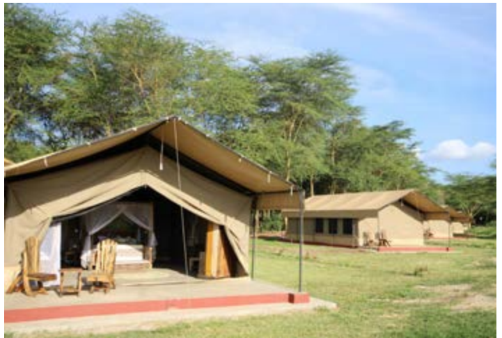
Africa Safari Lake Manyara