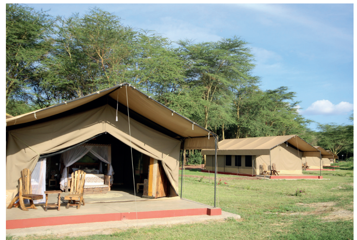
Africa Safari Lake Manyara