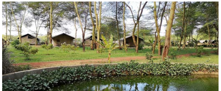
Africa Safari Lake Manyara